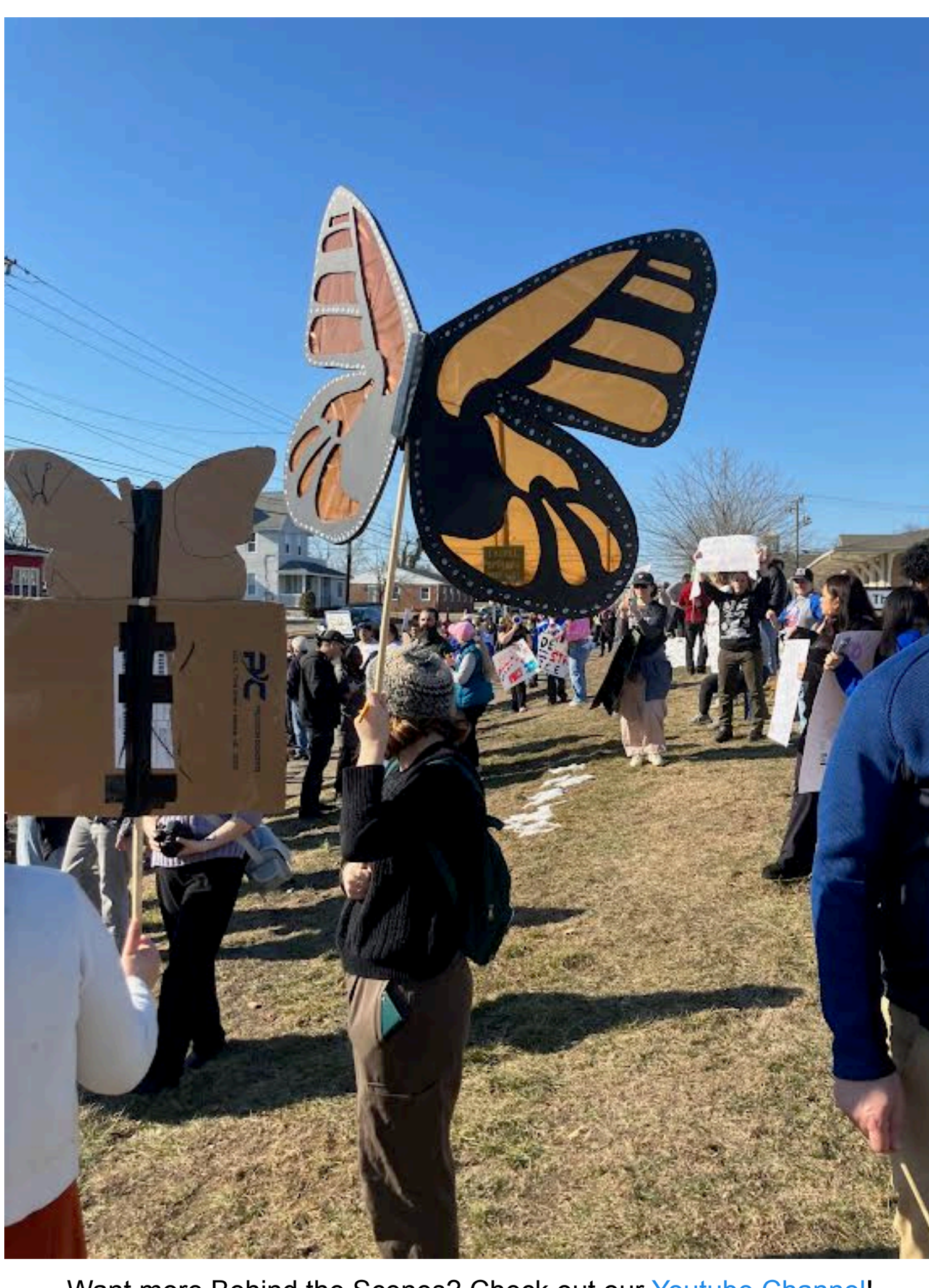
Want more Behind the Scenes? Check out our Youtube Channel!