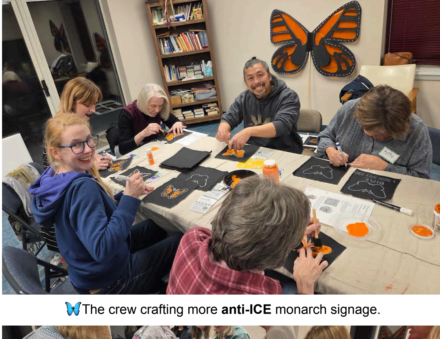
The crew crafting more anti-ICE monarch signage.

We had a PACKED House last Friday. At 35+ people crafting together, it might be the most people we've ever had! Below, the team is hard at work on monarch patches for our Rapid Responders .